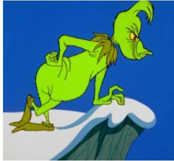
The Grinch Gg, FF, ss, Bb